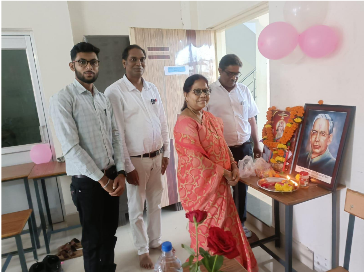
05. Teachers Day Celebration: